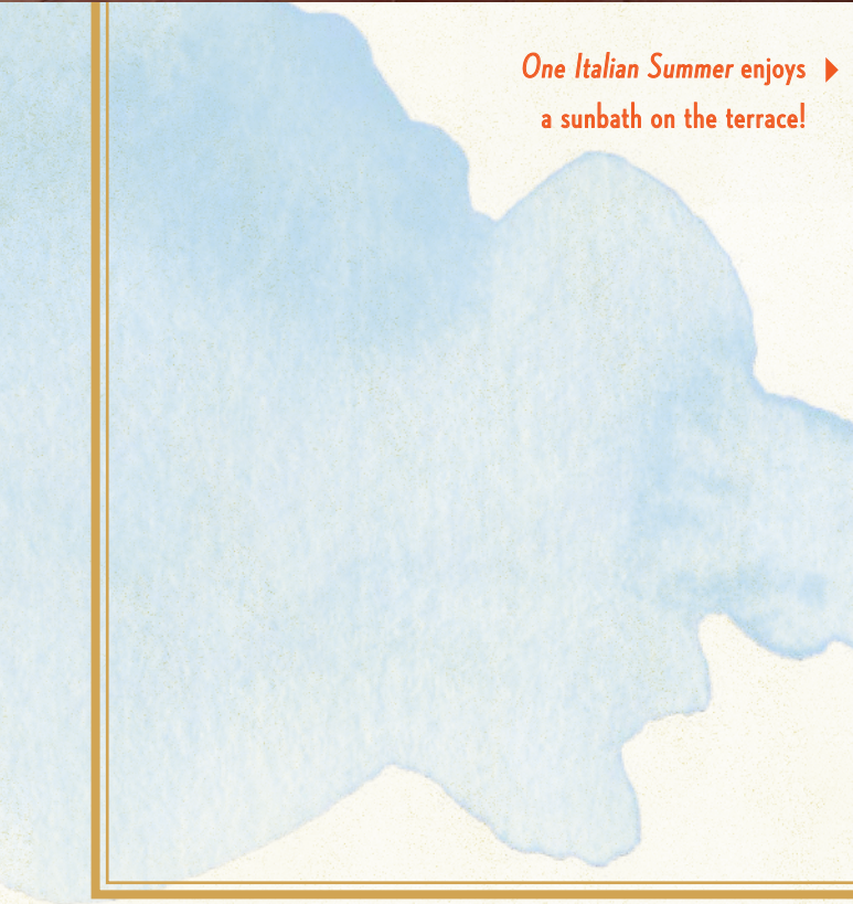
One Italian Summer enjoys ▶ a sunbath on the terrace!