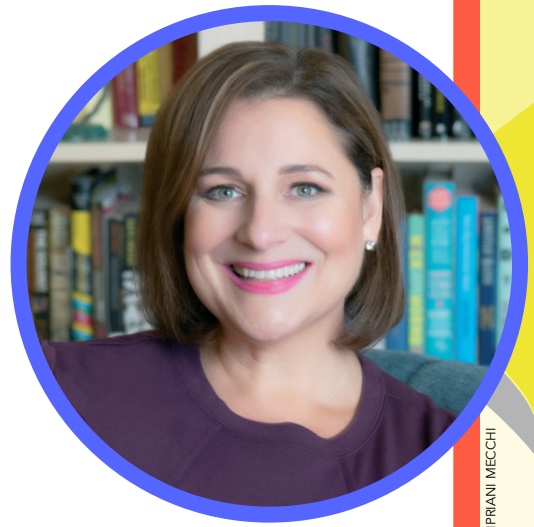
AUTHOR PHOTO © ANDREA CIPRANI MECCHI

Anyone who's on social media is engaging in a kind of performance.