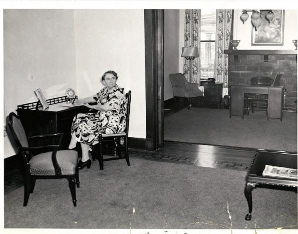
Georgia Tann posing in the reception parlor of the Poplar Street Mansion that served as her main orphanage and the headquarters for her child brokering business.

A TCHS ward offered as "Yours for the Asking!" in the Memphis paper. Such ads became so commonplace that some citizens of Memphis looked forward to the photos of the cute orphans with catchy titles and stories.